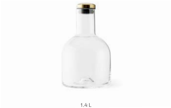
1.4 L 4685839