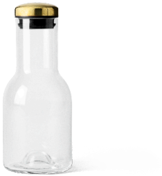
0.5 L 4681839