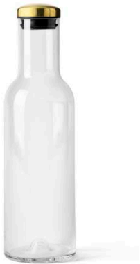
1.0 L 4680839